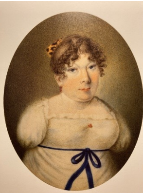
1812—Sarah Biffin, Self Portrait. 3.5”H Watercolor on ivory

Sarah Biffin is an artist born in Somerset, England in the late 1700’s. A truly amazing woman, who was born without arms, hands or legs, yet mastered writing with pen & pencil as well as the art of fine needlework. She could thread a needle, use scissors and make her own clothes by the age of twelve, all using her mouth and shoulder. By age 20, Sarah decided she wanted to paint and began a tour of the country, exhibiting (as an ‘oddity’) in fairs where she would write, sew and paint miniatures (less than 4” high) on ivory using her mouth and shoulder, in front of audiences, who were charged an admission fee and given a writing sample as part of the ticket price.