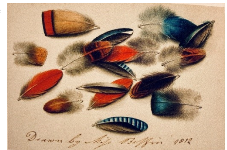
1812 Pencil & watercolor on paper study of feathers, 4x6”