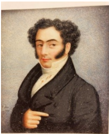
1822—Gentleman in black coat. 3” x 3.5” Watercolor on ivory

When Sarah was 35 she met George Douglas, the 16th Earl of Morton and with his encouragement, Sarah decided to go it alone. Impressed by Sarah’s talent, the Earl of Morton presented her work before King George III and assumed an informal role as counsel on major career decisions. She soon became a celebrated artist in her own right and was painting portraits for kings and queens, nobles and other celebrities of the time. Charles Dickens referred to her in several of his novels. She was described as “The Wonderful Curiosity” and “The Limbless Wonder”. In 1821 she received a silver medal from the Society of Arts, which was an incredible achievement as a woman, let alone a single, disabled woman. She achieved international recognition in 1821 when she travelled to Brussels and was appointed miniature painter to Willem Frederik, Prince of Orange and future king of the Netherlands. Biffin took out adverts in local newspapers and directed visitors to her exhibition in the heart of the historic and artistic center of Brussels. For the price of two francs 50